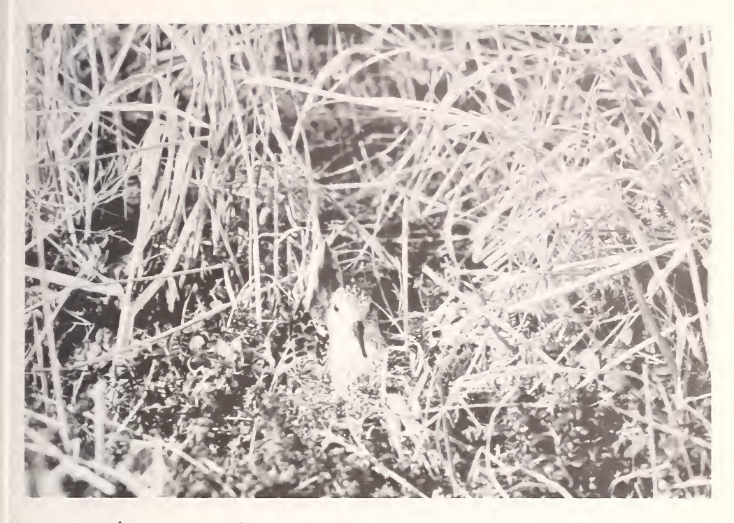
Fig. 14. Western sandpiper on a nest in typical nesting habitat.

Nesting pairs used dwarf shrub mat and dwarf shrub meadows along the coast and treeless bogs, wet dwarf shrub meadows, and dwarf shrub mat habitats inland. At Cape Peirce and Nanvak Bay, birds arrived early in spring (1–3 May) and began aerial displays above their nesting habitat on 13–16 May. Pairs and singles were present at Chagvan Bay on 20–27 May 1987, although no aerial displays were seen (D. F. Parmelee and J. M. Parmelee, unpublished). J. Sargent observed a pair copulating there on 20 May 1987 ( in D. F. Parmelee and J. M. Parmelee, unpublished). In all years at Cape Peirce, complete clutches of four eggs were found between 31 May and 19 June, and fledged young were common on the mudflats of Nanvak Bay by mid-July. Most adults were absent from nesting territories by early July and from intertidal areas by early August.